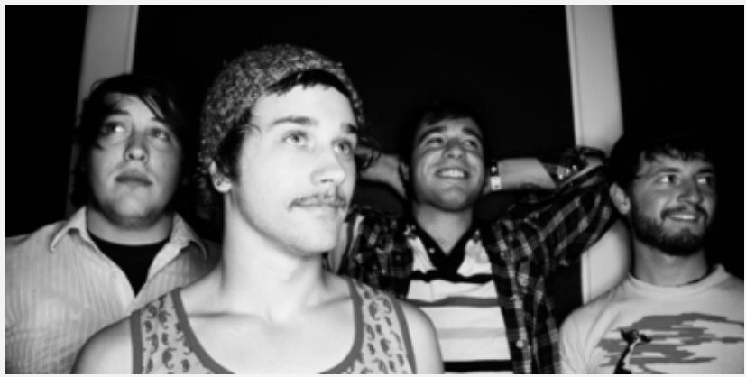
John Baldwin Gourley of Portugal. The Man sat down with 20 Watts for a nice long chat. Here's what he had to say!

PREVIEW: Click to access music and more info on Portugal. The Man!